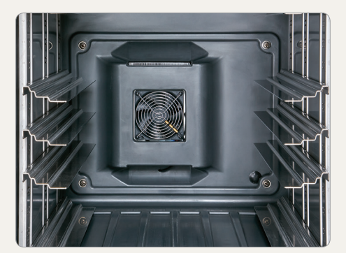
Interior with Cold module