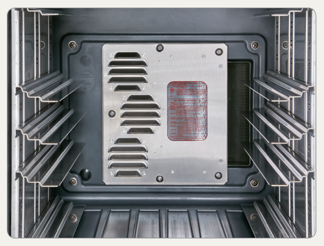
Interior with Hot module