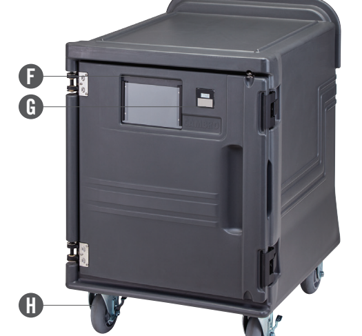
Electric Models Only