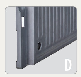
Gasket-free Door: For easy cleaning and fewer replacement parts. Door opens full 270°.