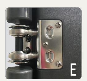
Stainless Steel Hinge: For long term durability.