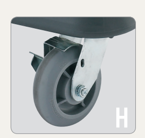
Standard 6" x 2" Heavy Duty Casters: Two non-marking, highperformance, swivel casters with brakes in the front and two rigid casters in the back for smooth positioning and navigation.