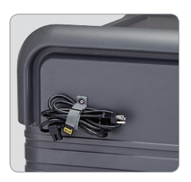
Cord Keeper: Safely and securely stores detachable 9' power cord.