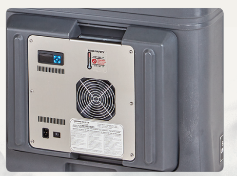
Exterior back with Cold module