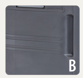
Polyethylene Exterior: Keeps food moist naturally and remains cool to the touch during operation, unlike metal cabinets.