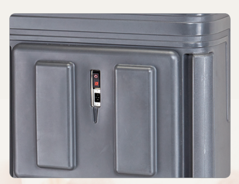
Exterior back with Hot module