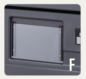
5" x 8" Menu Pocket: Allows for easy product ID with either an index card or by writing directly onto smooth surface with a grease pencil.