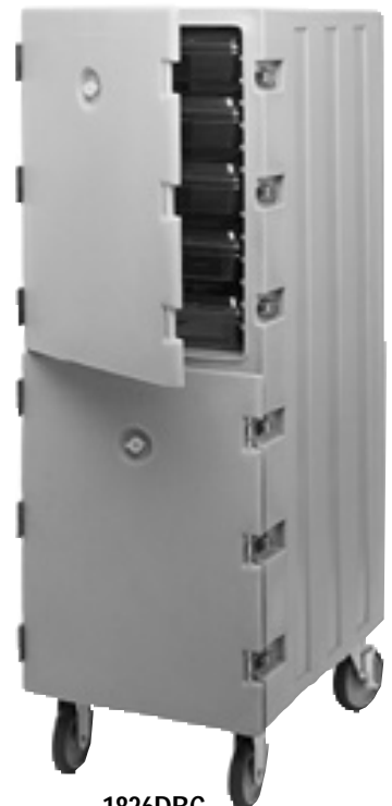
1826DBC (For Food Storage Boxes)