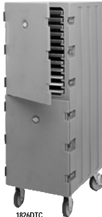
1826DTC (For Trays & Sheet Pans)