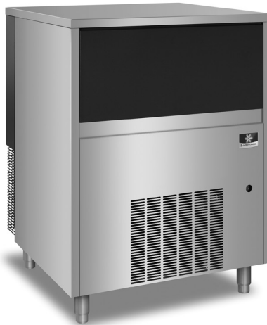
Model UNP0300A Nugget Ice Machine