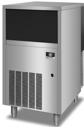
Model UNP0200A Nugget Ice Machine