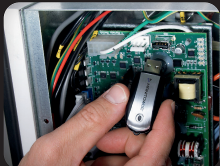
USB Port Firmware Updates