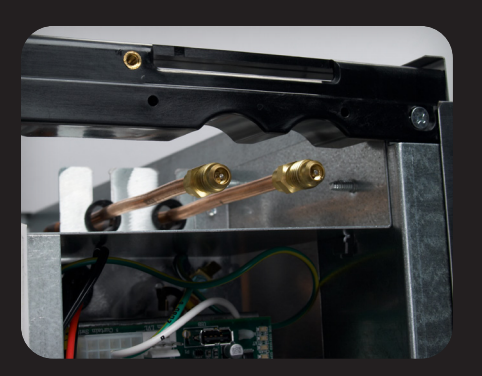
Easy Frontal Service Access Ports