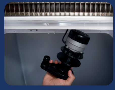
Snap-fit water pump