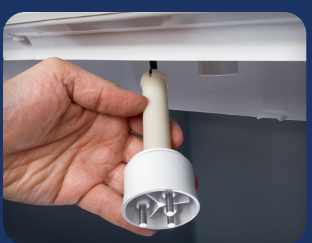
Snap-fit water probe