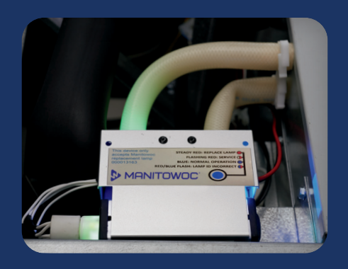
LuminIce II Growth Inhibitor accessory

free from contamination. For those occasions when the scoop must be keep outside the bin, there is an optional NSF approved, external scoop holder which keeps the ice scoop covered and conveniently located.