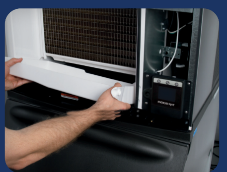
Removable water trough