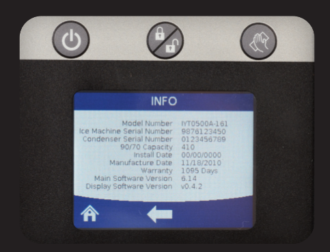
One touch machine info