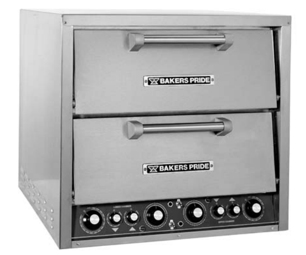
Model DP2 with optional top & bottom heat controls