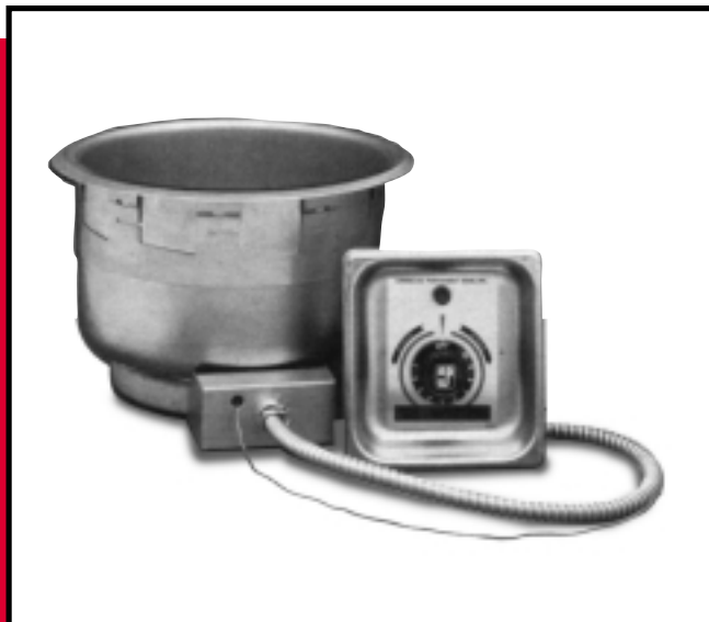
MODEL SM-50-11D UL HOT FOOD WELL