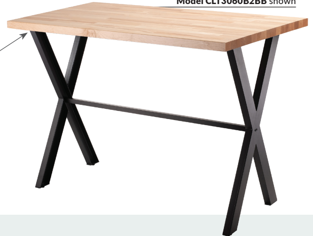
Model CLT3060B2BB shown