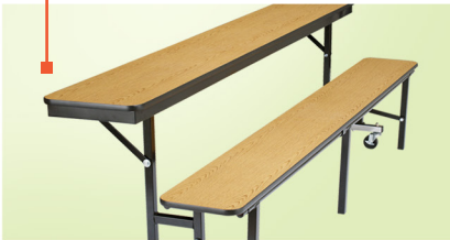
Rotate the backrest 75° to provide a versatile writing surface, ideal for classroom instruction, testing and study hall use

SAFETY FEATURE No trip points around top in classroom setup.