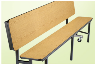
Use as a comfortable bench with back for assembly seating

SAFETY FEATURE "Pinch-proof" folding feature: Bench does not touch the top when folding.