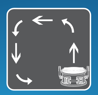
Fan placement helps to create drying pattern for hard to reach areas effected by unwanted moisture.