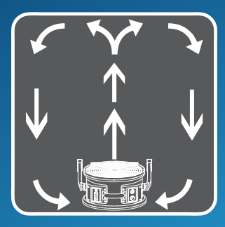
High torque motor provides a continuous flow of air to shorten drying times.